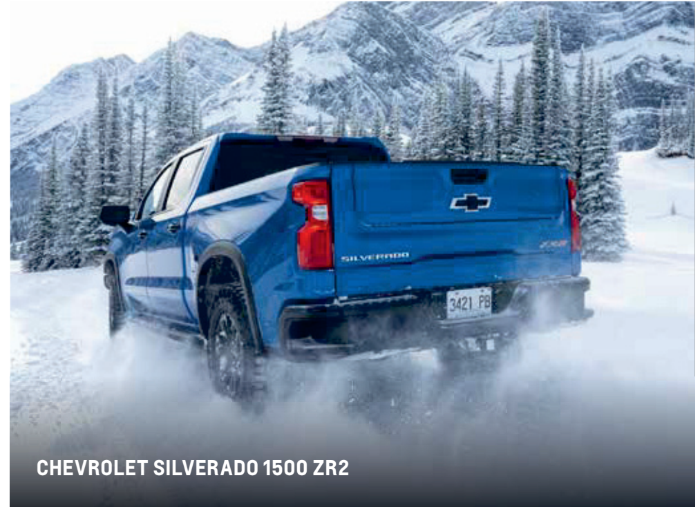
CHEVROLET SILVERADO 1500 ZR2