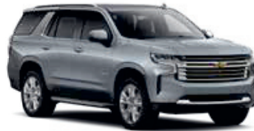
Sterling Gray Metallic – GXD