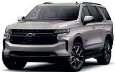
Empire Beige Metallic - GJW