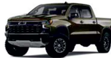
Harvest Bronze Metallic – GXN