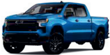
Glacier Blue Metallic - GLT