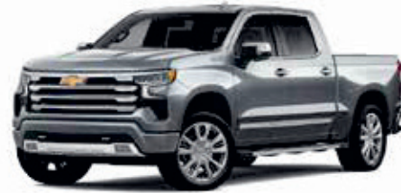
Sterling Gray Metallic – GXD