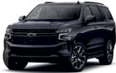
Dark Ash Metallic - G6M