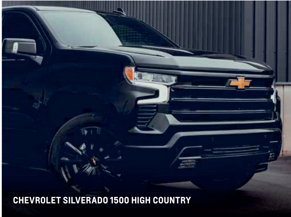
CHEVROLET SILVERADO 1500 HIGH COUNTRY