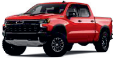
Red Hot – G7C