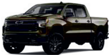
Harvest Bronze Metallic - GXN