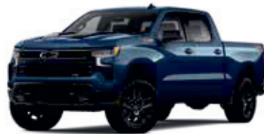
Lakeshore Blue Metallic - GXP