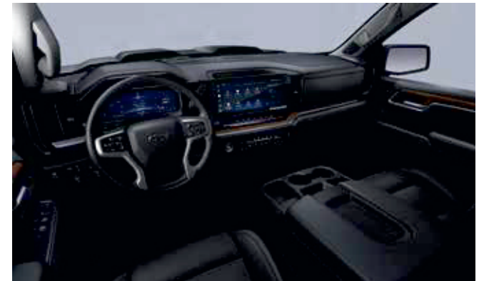
Leather Jet Black - H0Y