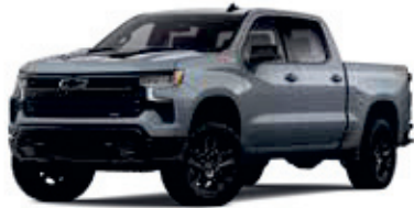
Slate Gray Metallic - GNO