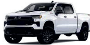
Summit White - GAZ