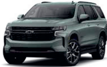
Silver Sage Metallic - G6N