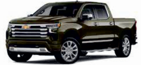
Harvest Bronze Metallic – GXN