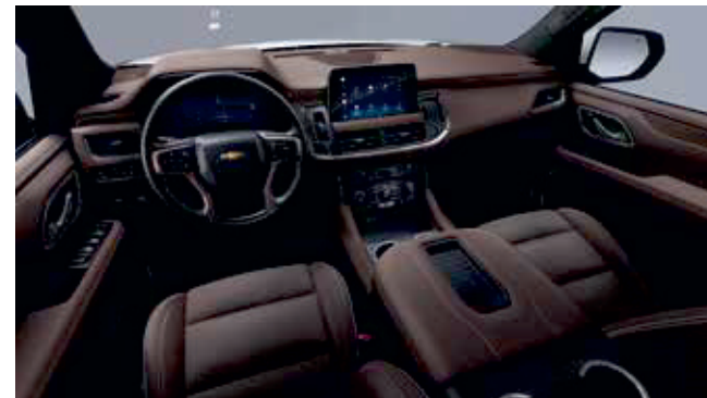
Jet Black/Mocha, Perforated leather seating surfaces 1st and 2nd row – HVB