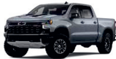
Slate Gray Metallic – GNO