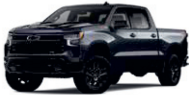
Dark Ash Metallic - G6M