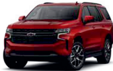
Radiant Red Metallic - GNT