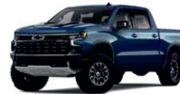
Lakeshore Blue Metallic – GXP