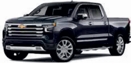
Dark Ash Metallic – G6M