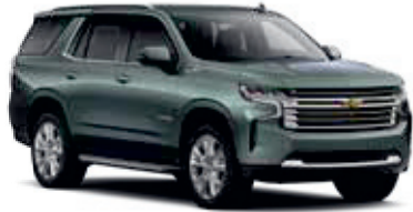
Silver Sage Metallic – G6N