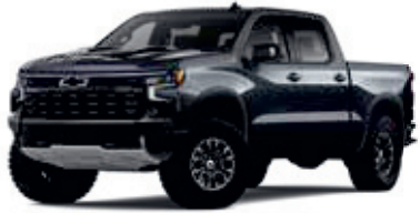
Dark Ash Metallic – G6M