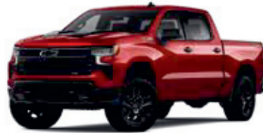
Radiant Red Metallic - GNT