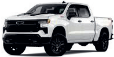
Iridescent Pearl Tricoat - G1W