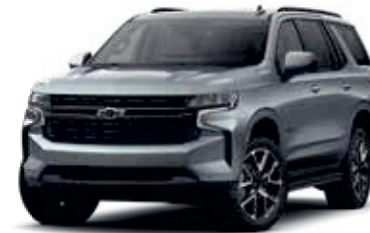
Sterling Grey Metallic - GXD