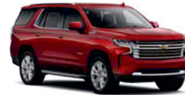
Radiant Red Tintcoat – GNT