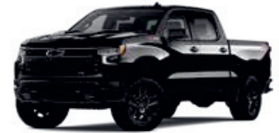
Black - GBA