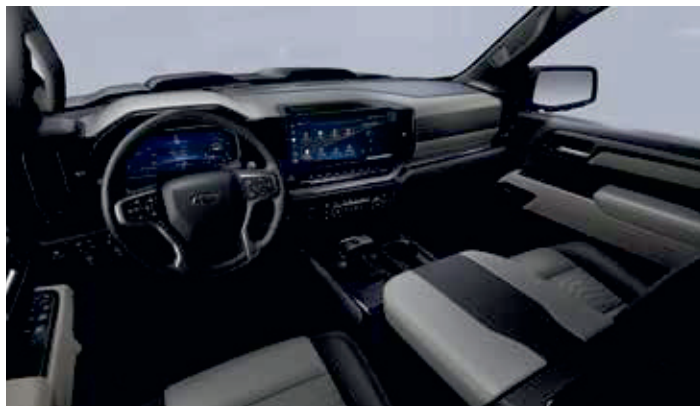
Greystone – H37