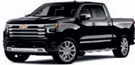
Black – GBA