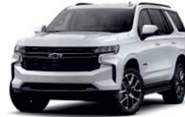
Summit White - GAZ