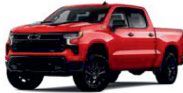
Red Hot - G7C