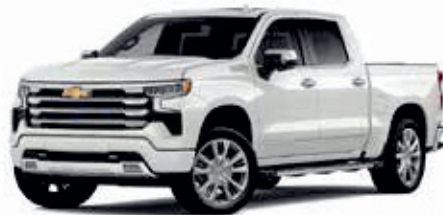
Iridescent Pearl Tricoat – G1W