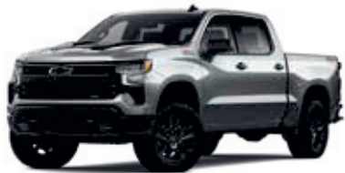
Sterling Grey Metallic - GXD