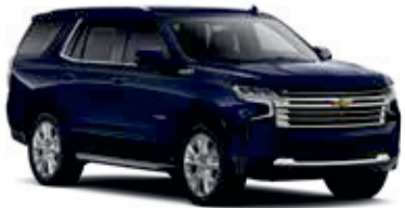
Midnight Blue – GLU