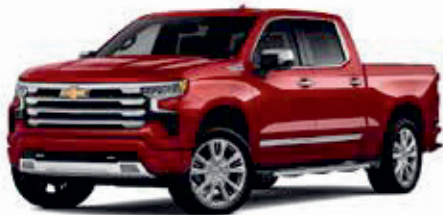
Radiant Red Tintcoat – GNT