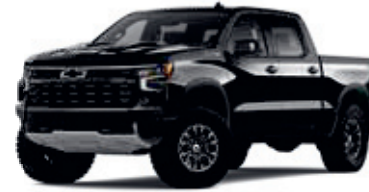
Black – GBA