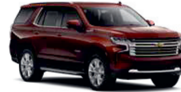
Auburn Metallic – G48