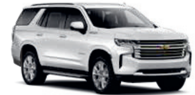
Iridescent Pearl Tricoat – G1W