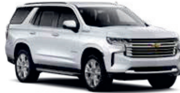
Summit White – GAZ