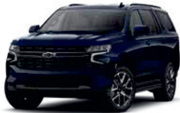
Midnight Blue Metallic - GLU