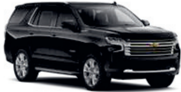
Black – GBA