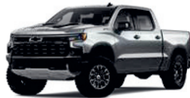
Sterling Gray Metallic – GXD