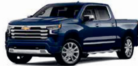
Northsky Blue Metallic – GA0