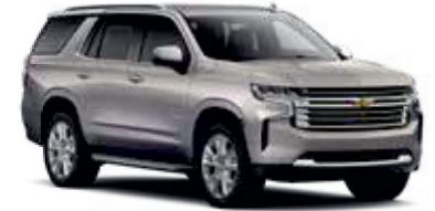
Empire Beige Metallic – GJW