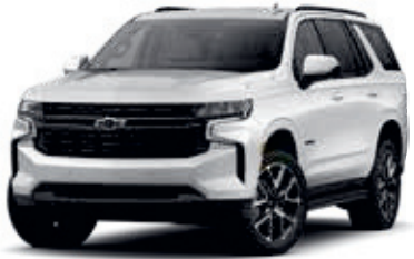
Iridescent Pearl Tricoat - G1W