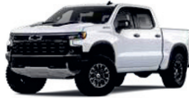
Summit White – GAZ