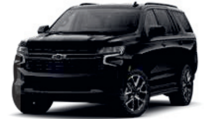
Black - GBA