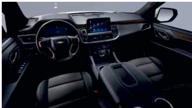
Jet Black, Perforated leather seating surfaces 1st and 2nd row – HMR