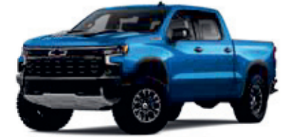
Glacier Blue Metallic – GLT