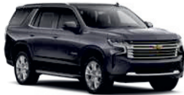
Dark Ash Metallic – G6M