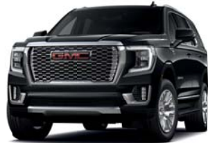
ONYX BLACK (GBA)