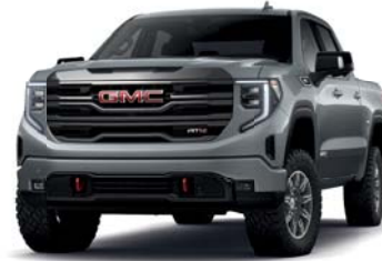
THUNDERSTORM GRAY (GNO)