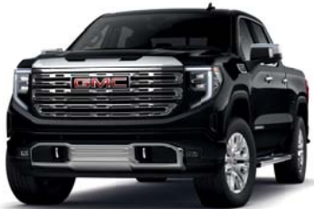
ONYX BLACK (GBA)