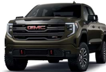
DEEP BRONZE METALLIC (GXN)