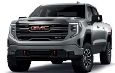
STERLING METALLIC (GXD)