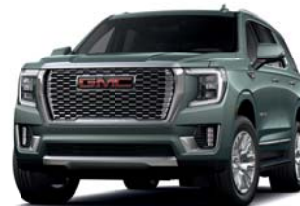
FROSTED PINE METALLIC (G6N)