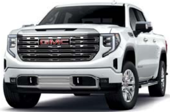
SUMMIT WHITE (GAZ)