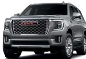
STERLING METALLIC (GXD)