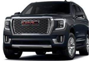
TITANIUM RUSH METALLIC (G48)