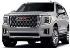
PEARL BEIGE METALLIC (GJW)