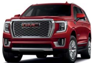
VOLCANIC RED METALLIC (GNT)