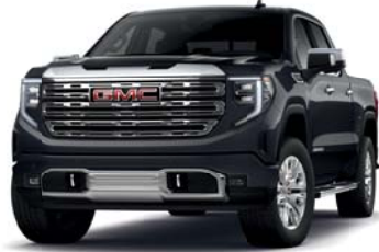
TITANIUM RUSH METALLIC (G6M)