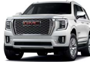
WHITE FROST TRICOAT (G1W)