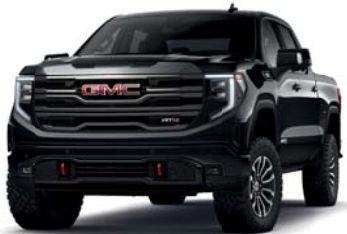
ONYX BLACK (GBA)