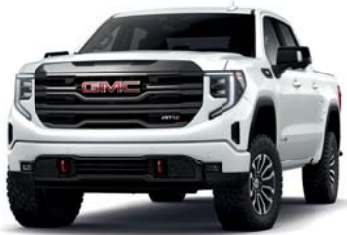
SUMMIT WHITE (GAZ)