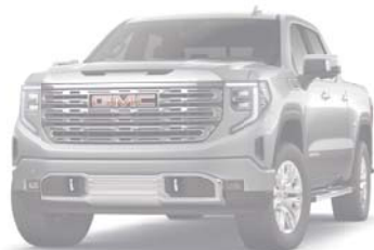
THUNDERSTORM GRAY (GNO)*