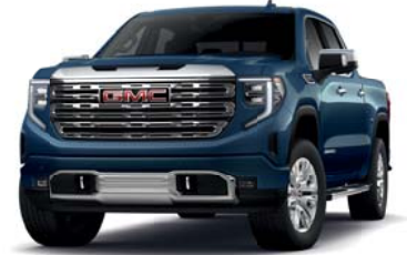
DOWNPOUR METALLIC (GXP)