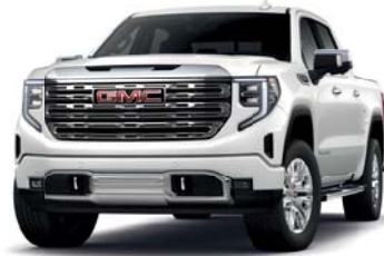
WHITE FROST TRICOAT (G1W)