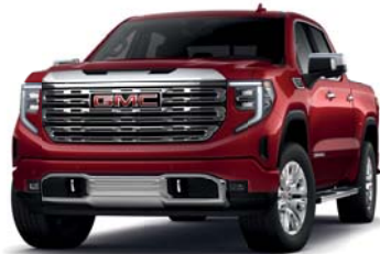
VOLCANIC RED METALLIC (GNT)