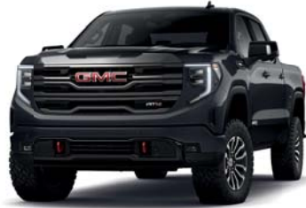
TITANIUM RUSH METALLIC (G6M)