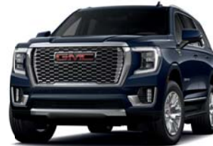
MIDNIGHT BLUE METALLIC (GLU)