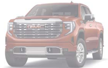
CARDINAL RED (G7C)*