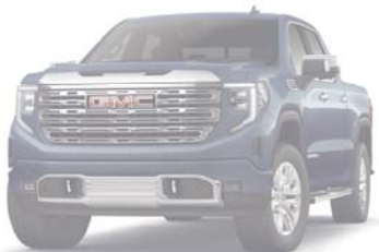
DYNAMIC BLUE METALLIC (GLT)*