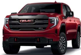
VOLCANIC RED METALLIC (GNT)