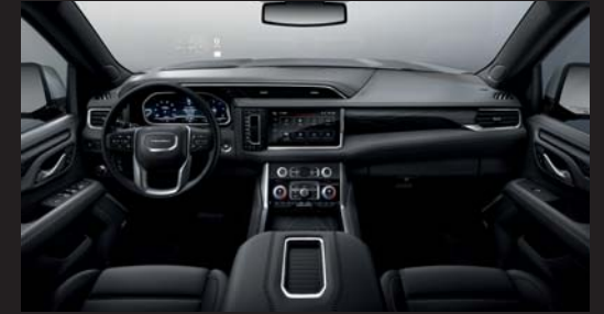
(H2X) Jet Black perforated leather seating surfaces with Jet Black interior decor