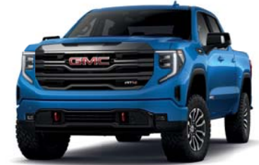
DYNAMIC BLUE METALLIC (GLT)