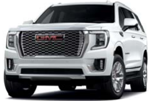
SUMMIT WHITE (GAZ)