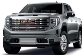
STERLING METALLIC (GXD)