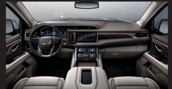
(HFM) Light Shale perforated leather seating surfaces with Teak interior decor