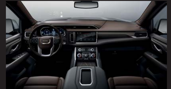
(HFN) Very Dark Ash Gray perforated leather seating surfaces with Dark Walnut interior decor