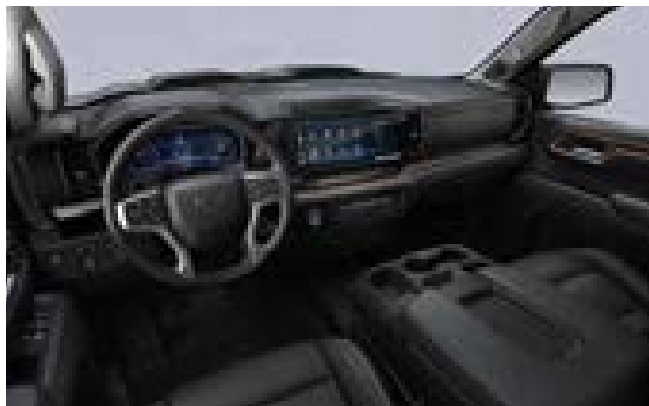
Leather Jet Black – HOY Available with all exterior colors