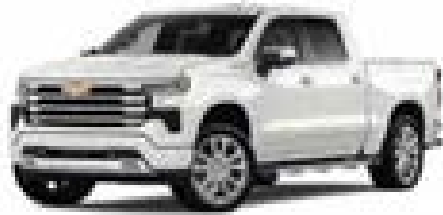
Iridescent Pearl Tricoat – G1W € 270