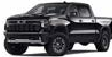
Black – GBA € 270