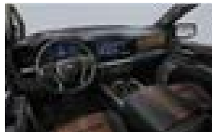
Jet Black/Umber, Perforated leather seating surfaces – HFO