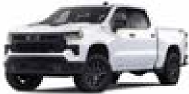
Summit White – GAZ € 270