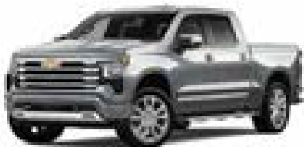
Sterling Gray Metallic – GXD € 270