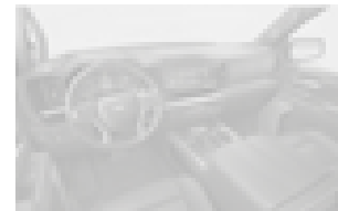
Jet Black/Nightshift Blue, Perforated leather seating surfaces – H38

Not available with Radiant Red exterior color