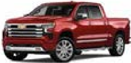
Radiant Red Tintcoat – GNT Free of Charge