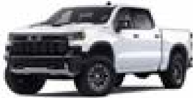
Summit White – GAZ € 270