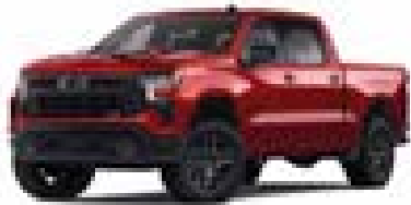
Radiant Red Metallic – GNT Free of Charge