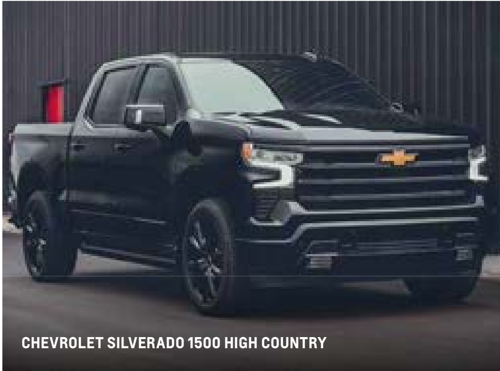
CHEVROLET SILVERADO 1500 HIGH COUNTRY