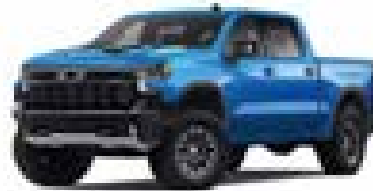
Riptide Blue – GJV € 270