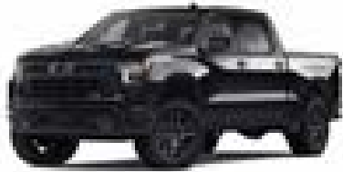
Black – GBA € 270