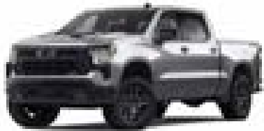
Sterling Grey Metallic – GXD € 270