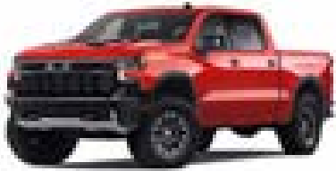
Red Hot – G7C Free of Charge