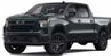
Cypress Gray – GBD € 270