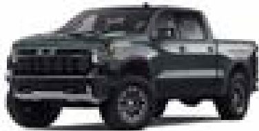
Cypress Gray – GBD € 270