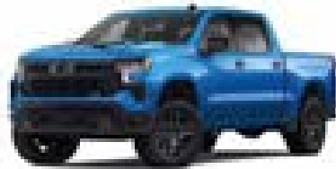
Riptide Blue – GJV € 270