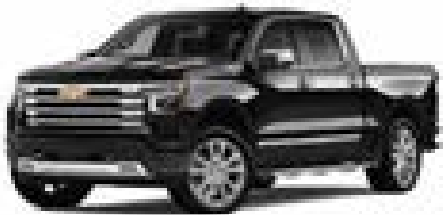
Black – GBA € 270