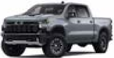
Slate Gray Metallic – GNO € 270