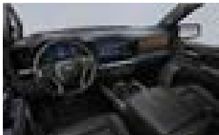
Jet Black, Perforated leather seating surfaces 1st and 2nd row – HXC