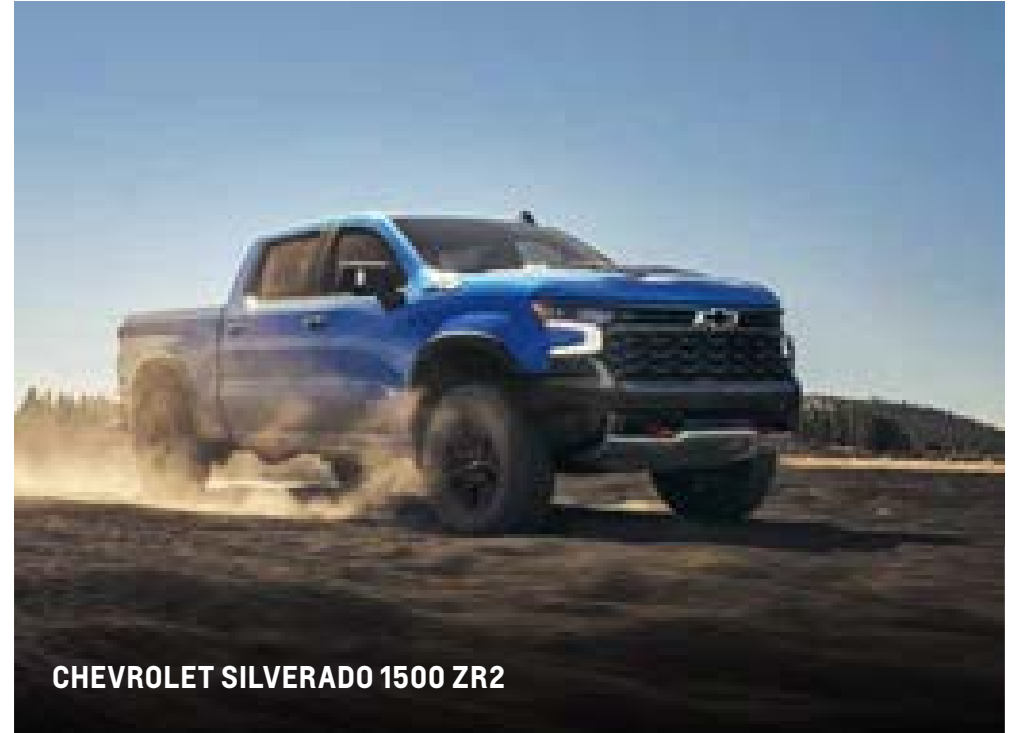
CHEVROLET SILVERADO 1500 ZR2