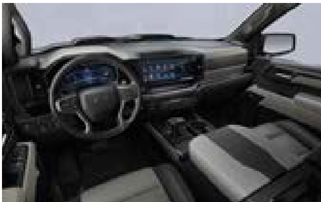
Greystone – H37