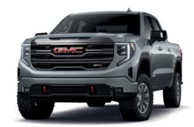
THUNDERSTORM GRAY (GNO) € 270