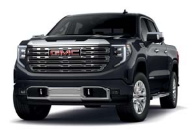
TITANIUM RUSH METALLIC (G6M) € 270