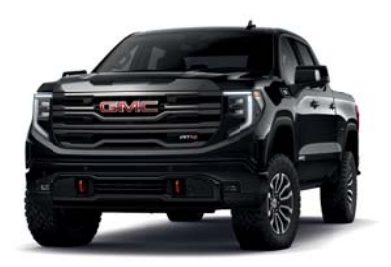
ONYX BLACK (GBA) € 270