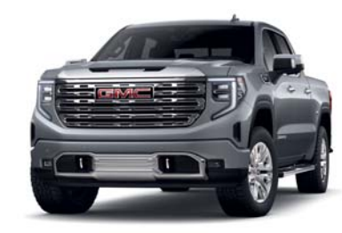
THUNDERSTORM GRAY (GNO) € 270