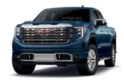
DOWNPOUR METALLIC (GXP) € 270