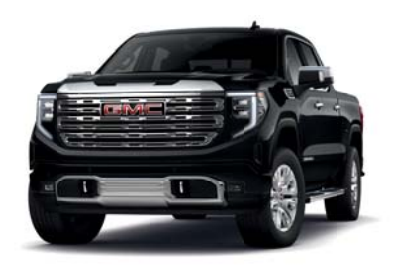
ONYX BLACK (GBA) € 270