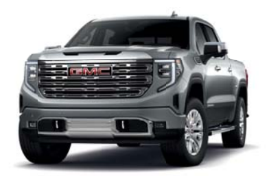
STERLING METALLIC (GXD) FREE OF CHARGE