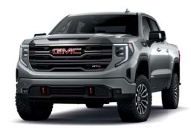
STERLING METALLIC (GXD) € 270