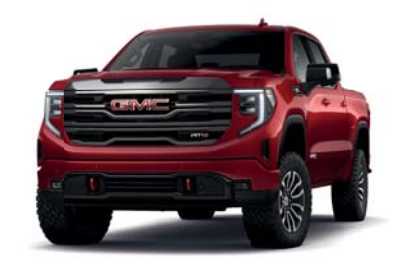
VOLCANIC RED METALLIC (GNT) FREE OF CHARGE