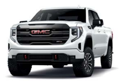
SUMMIT WHITE (GAZ) € 270