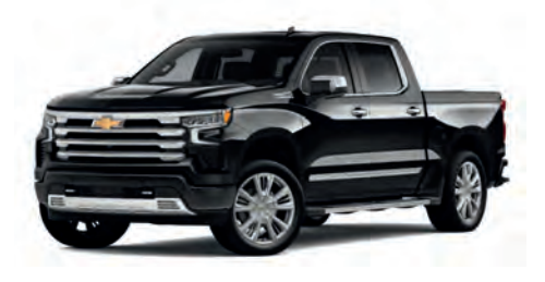
Black – GBA € 270